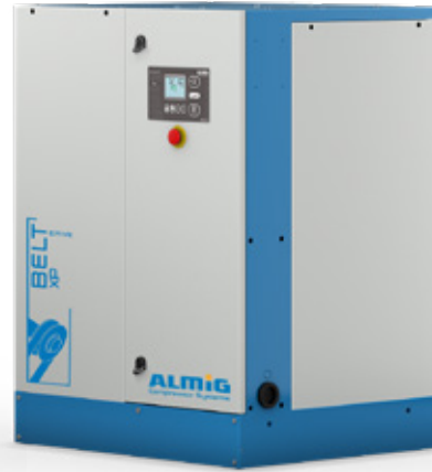
BELT XP 8-15