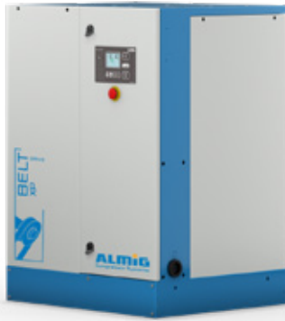
BELT XP 4-6