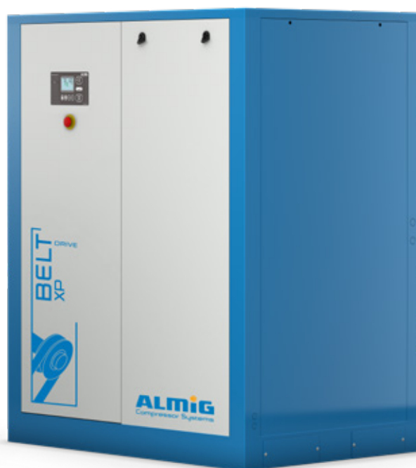
BELT XP 30-37