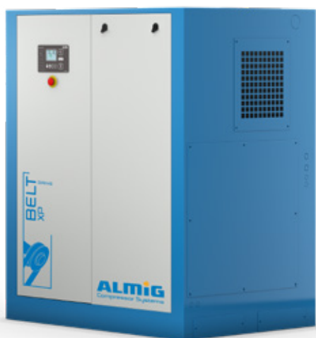
BELT XP 16-22