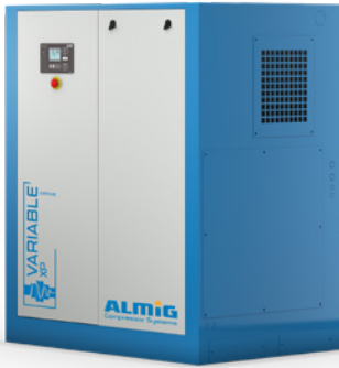
VARIABLE XP 22