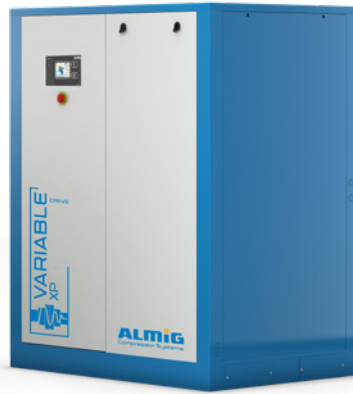
VARIABLE XP 30 - 37