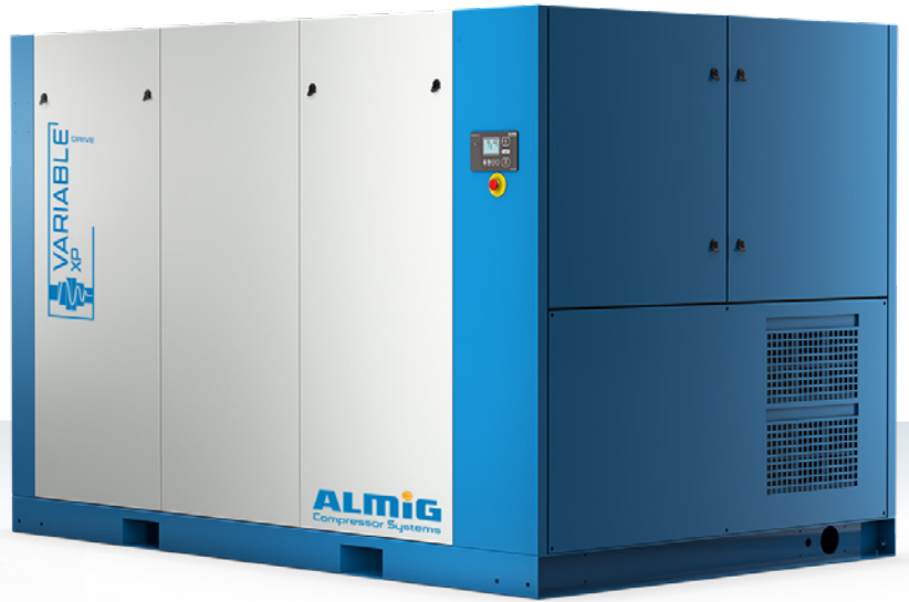
VARIABLE XP 110 - 200