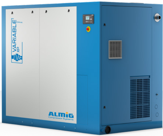
VARIABLE XP 75 - 90