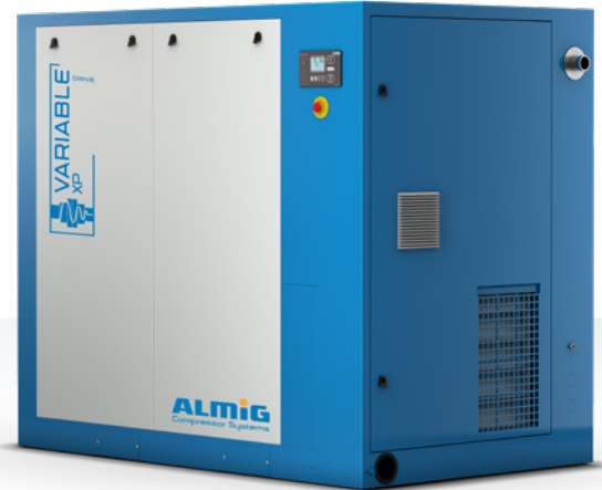
VARIABLE XP 45 - 55